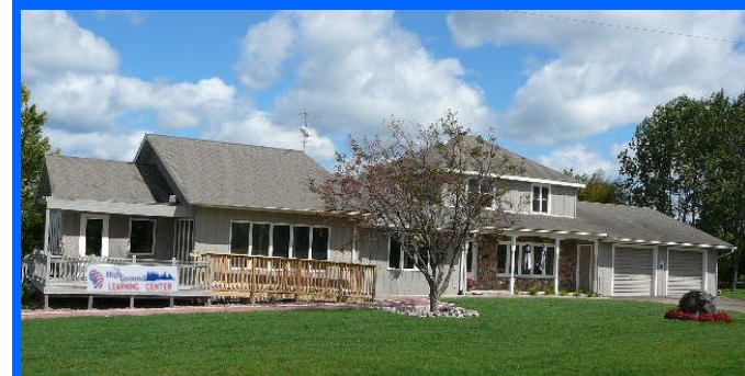
The Highground Learning Center

It is the vision of The Highground to honor human courage and sacrifice wherever it is displayed, without either denying or glorifying the pain and suffering of war and of life.